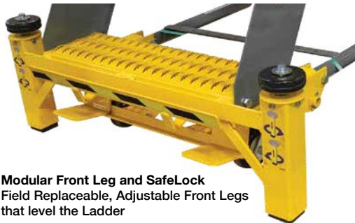
Modular Front Leg and SafeLock Field Replaceable, Adjustable Front Legs that level the Ladder