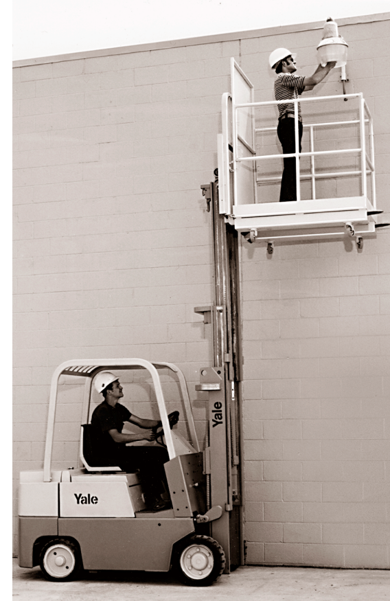
SERVICING AND MAINTENANCE