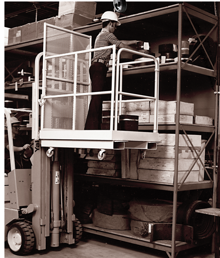
STOCKING AND RETRIEVAL