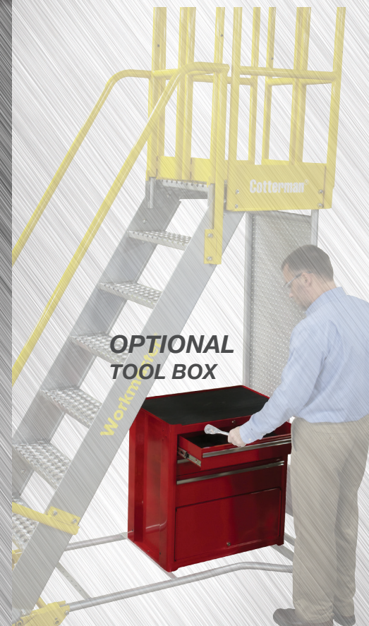
OPTIONAL TOOL BOX