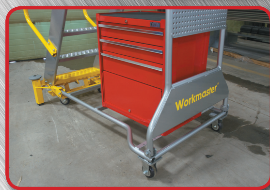
HEAVY DUTY CASTERS, CURVED BASE AND BACK PANEL AND BOLT LOCATION FOR EASY ASSEMBLY