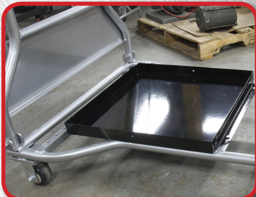
OPTIONAL UTILITY TRAY 150 lb. CAPACITY