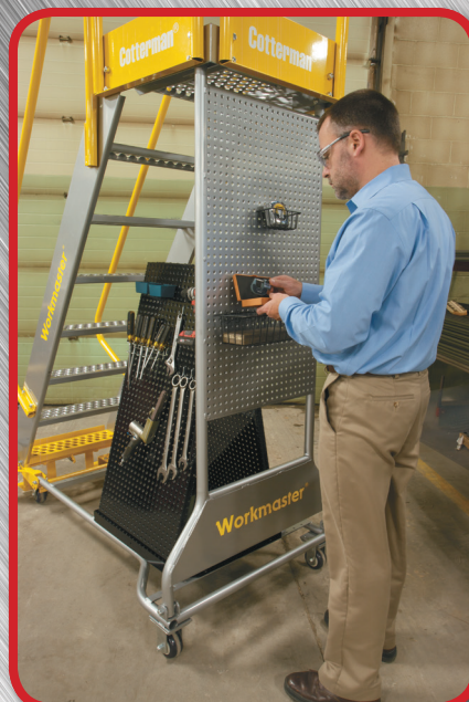
STANDARD BACK TOOL BOARD