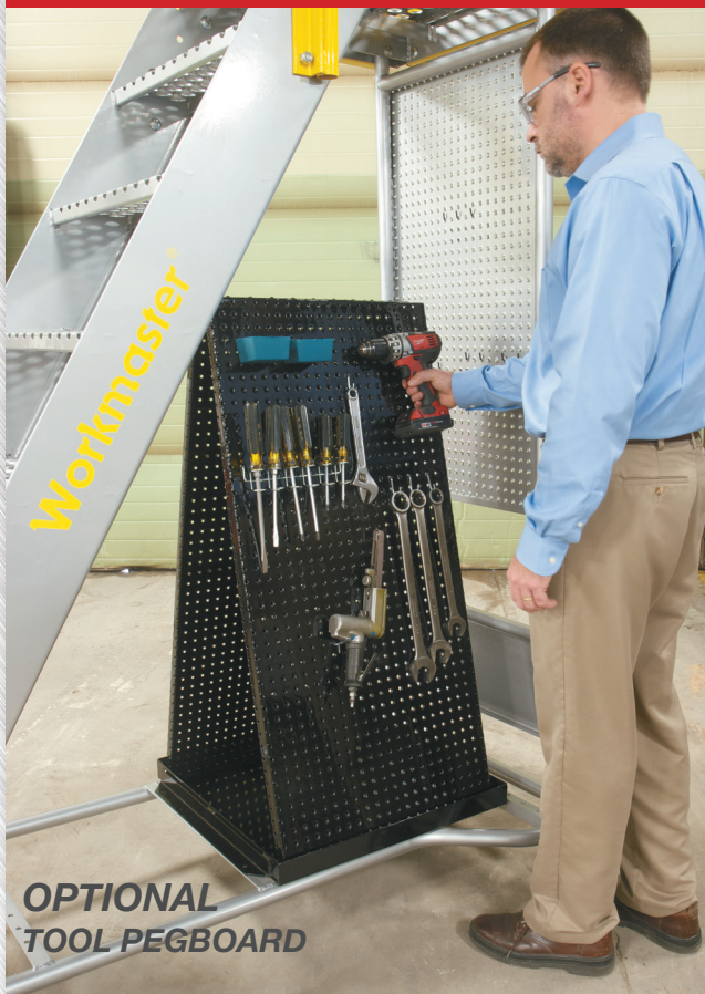
OPTIONAL TOOL PEGBOARD

For the toughest work areas, step up to the Cotterman Workmaster Super Duty.