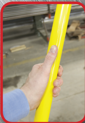
1.5" TUBE HANDRAILS POWDER COATED