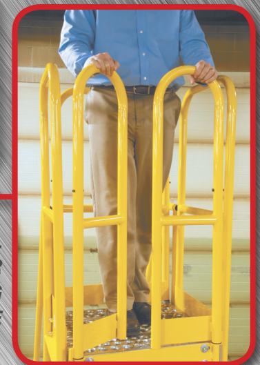
OPTIONAL REAR SELF-CLOSING GATE