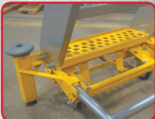
MODULAR FRONT LEG AND SAFELOCK FIELD REPLACEABLE, ADJUSTABLE FRONT LEGS LEVEL THE LADDER